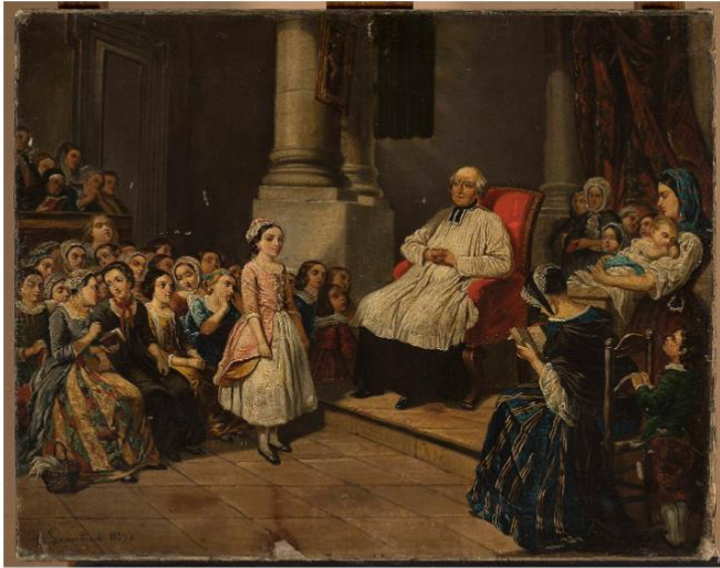
Catechism Lesson. 1859 Painting by Józef Szermentowski. National Museum in Warsaw Public Domain

The purpose of this catechism is to impart the vital beliefs and practices of the Christian faith. It is expected that this catechism will become a point of reference for the composition or revision of future catechisms that are contextualized for each context. This catechism is also a point of reference for church leaders, both clergy and laity, who are involved in the teaching and training of new believers; it is also a point of reference for all Christians