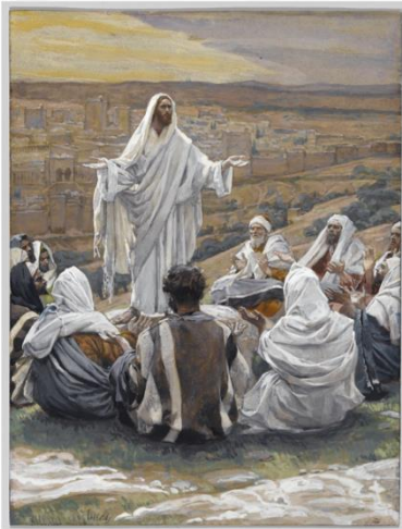
James Tissot's The Lord's Prayer (Le Pater Noster)

The Lord's Prayer, sometimes called Our Father (Latin: Pater Noster), is a cherished Christian prayer taught by the Lord Jesus Christ. This prayer unites all Christians around the world. The Lord's Prayer is a moral compass for believers seeking the Lord's guidance. It is noteworthy that Jesus' disciples requested from him to teach them how to pray. This is the prayer he gave